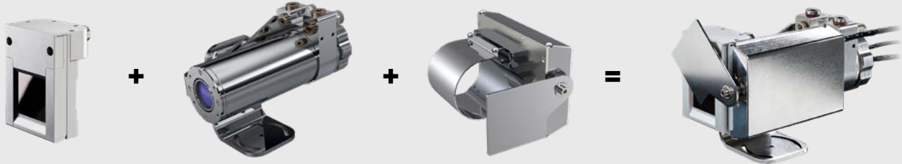
Air purge laminar